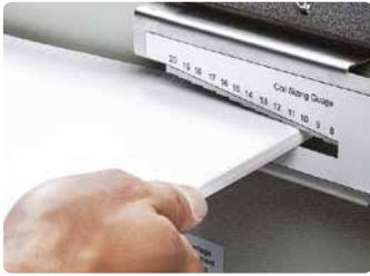
Built in coil sizing gauge.

The APSI 300 compact offers a built in coil sizing gauge to help the operator confirm the diameter of coil required in relation to the book thickness.