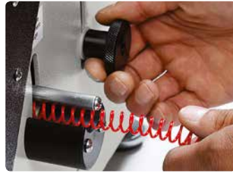
Coil diameter changeover

The APSI 300 compact has gravity working to its advantage. The pre-punched book is positioned in the machine on its spine meaning that tabs or wider covers are no problem.