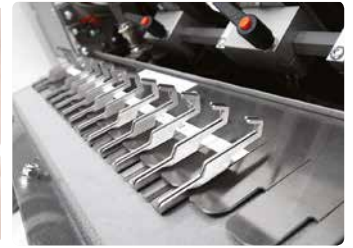
Built-in spine former storage.

Note: 8 mm coil is the smallest diameter that can be used.